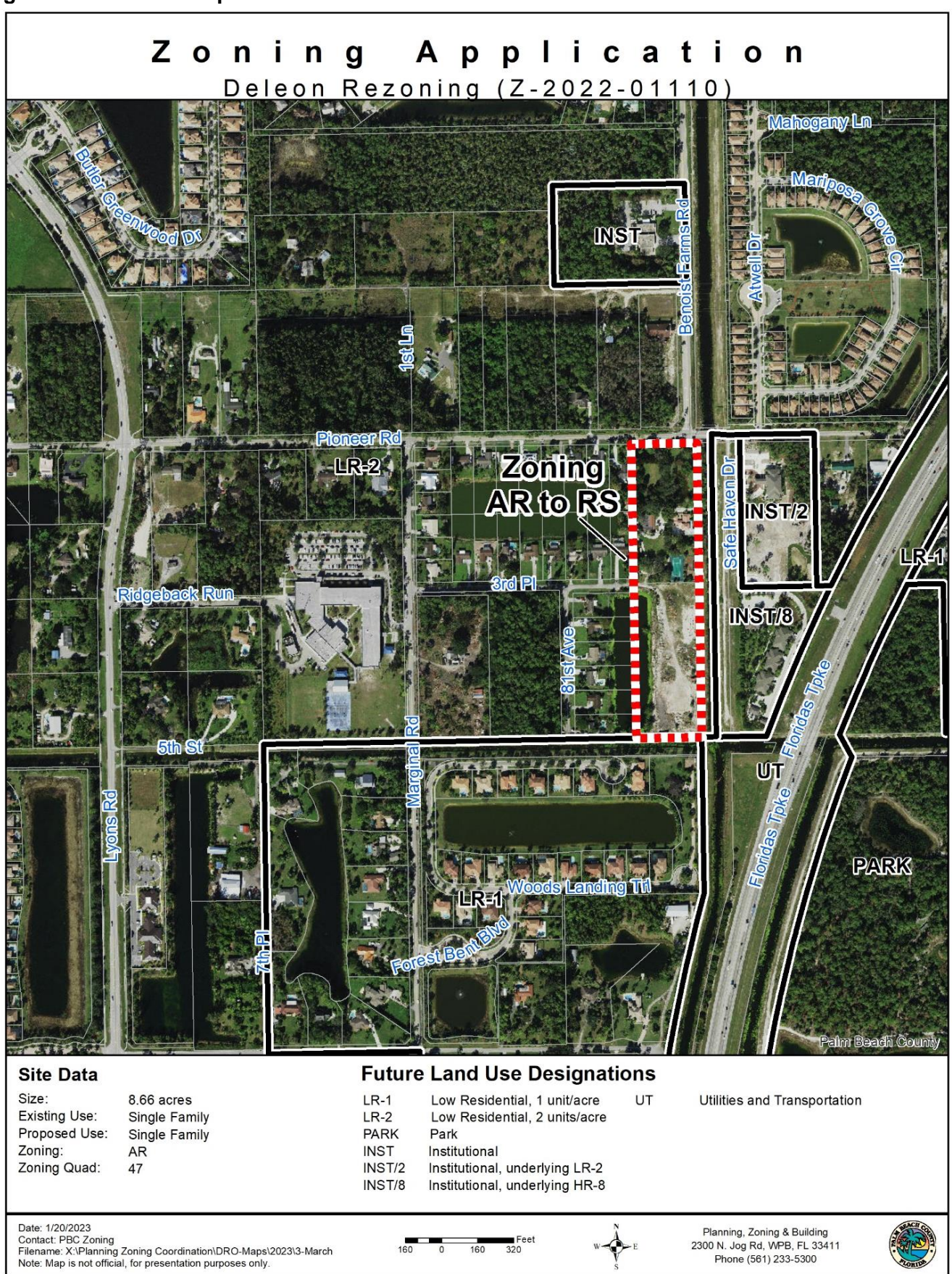
Figure 1 - Land Use Map